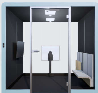
SPACE 4 Hybrid

exterior: W / H / D | 240 × 227 × 182cm | 94 × 89 × 72in interior: W / H / D | 220 × 216 × 170cm | 87 × 85 × 67in interior floor area: 3.7 sqm / 40.3 sqft