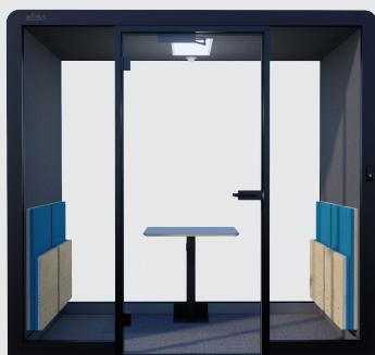
SPACE 2 Hybrid

exterior: W / H / D | 177 × 227 × 122cm | 70 × 89 × 48in interior: W / H / D | 157 × 216 × 110cm | 62 × 85 × 43in interior floor area: 1.7 sqm / 18.6 sqft