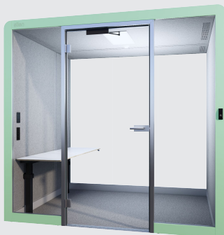
SPACE 2.5 Hybrid

exterior: W / H / D | 240 × 227 × 122cm | 94 × 89 × 48in interior: W / H / D | 220 × 216 × 110cm | 87 × 85 × 43in interior floor area: 2.4 sqm / 26 sqft